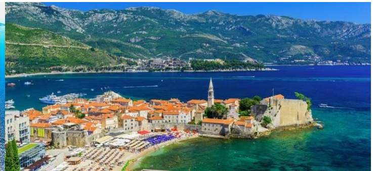
The City of Budva – Leading Tourist Resort (20 km away from Bar - north)