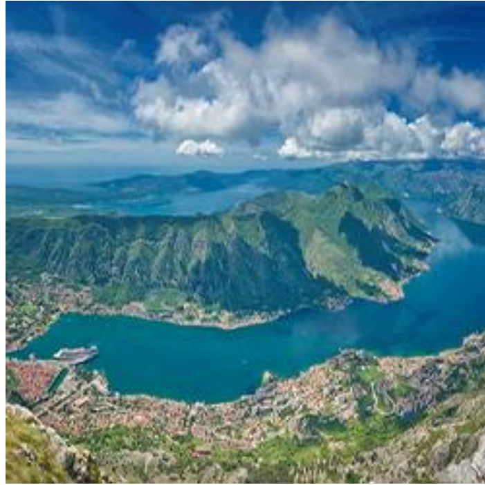
The Bay of Boka Kotorska with shore side around 100 km long - 50 km away from Bar