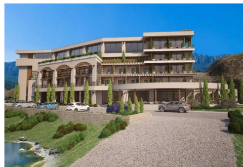
Venue of Second Day of the Bar Conference on the Skadar Lake Side - Hotel De Andro's