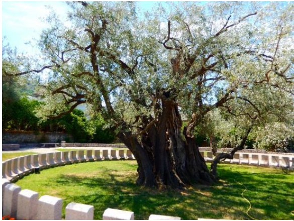
Oldest Olive Tree in Europe