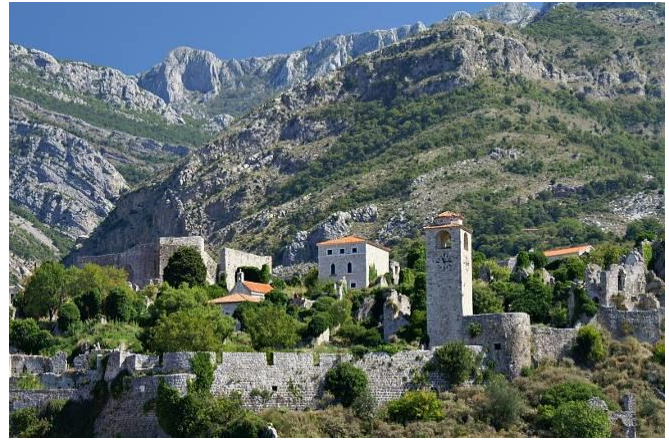
Old City of Bar, very near to downtown