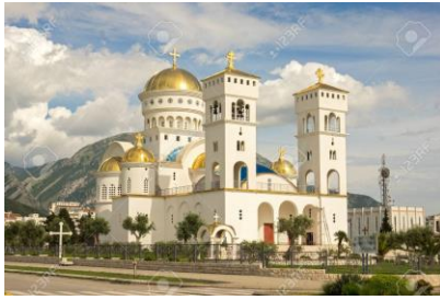
Orthodox Church of Saint Jovan Vladimir in Bar, Montenegro