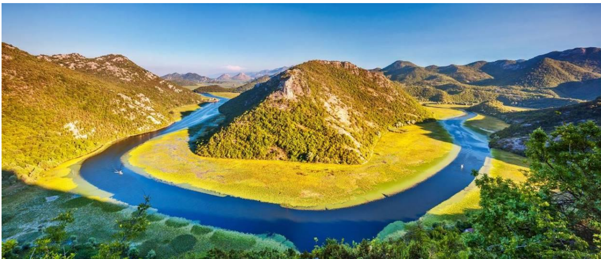
Skadar Lake close to Bar

The country's name derives from Venetian and translates to "Black Mountain", deriving from the appearance of Mount Lovćen when covered in dense evergreen forests. The native name Crna Gora came to denote the majority of contemporary Montenegro only in the 15th century.