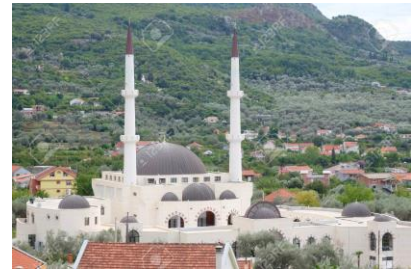
Mosque in Bar, Montenegro