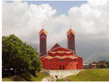
Catholic Church of St. Peter the Apostle, Bar, Montenegro