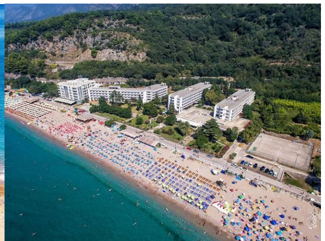
Some of the beautiful natural sandy beaches in Bar and surrounding Bar (Summer season since 1st May to 1st October)