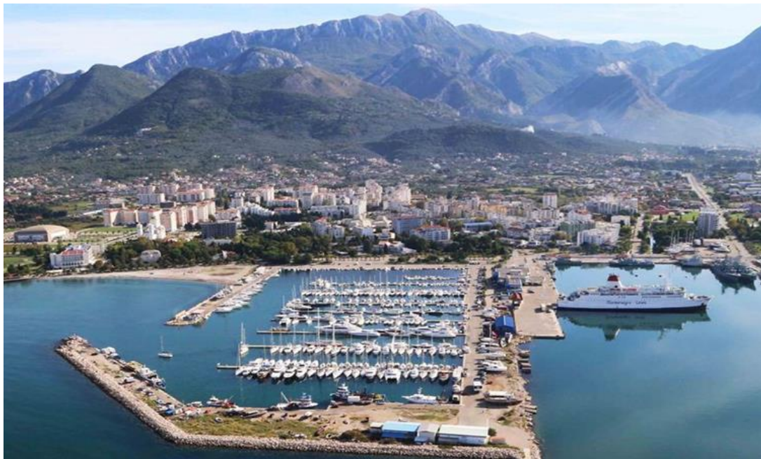
The City of Bar (View from the Sea)