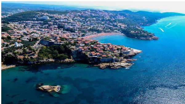
The City of Ulcinj – Tourist Resort (20 km away from Bar - south)